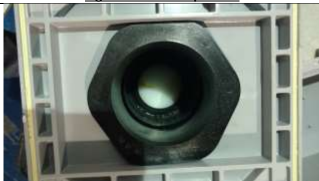
Figure 15: EUT Inspection