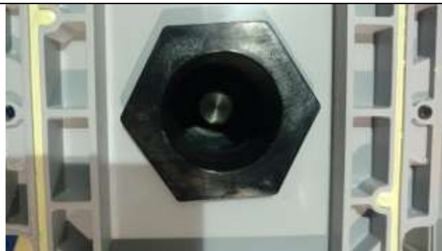
Figure 14: EUT Inspection