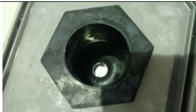
Figure 6: EUT Inspection