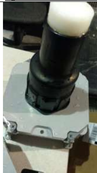
Figure 12: EUT Inspection