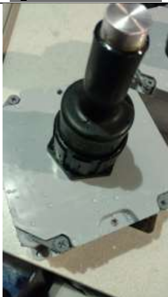
Figure 11: EUT Inspection