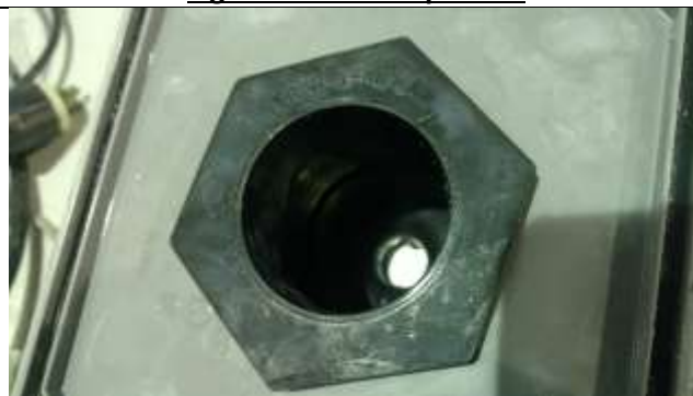
Figure 16: EUT Inspection