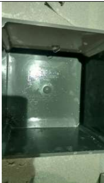
Figure 5: EUT Inspection