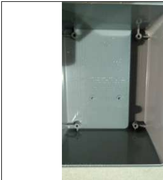
Figure 13: EUT Inspection