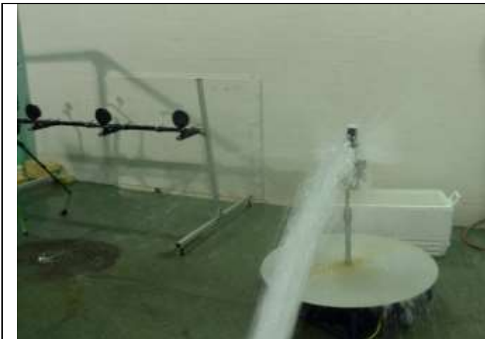
Figure 9: EUT Hosedown