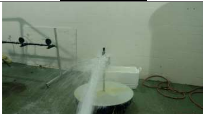
Figure 7: EUT Hosedown