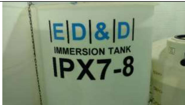
Figure 10: EUT Immersion