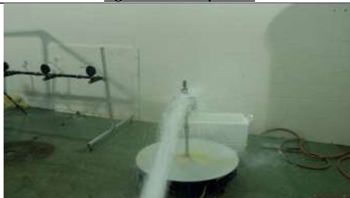
Figure 8: EUT Hosedown